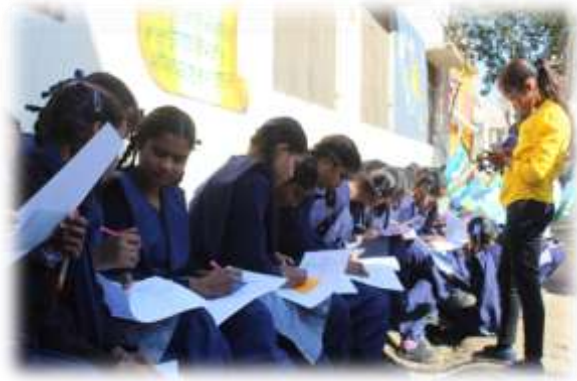
Students were filled feedback forms