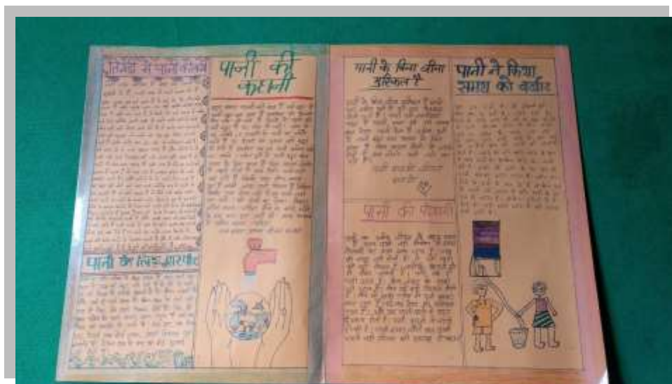
Broadsheet made by the learners on the theme “Water”

In 2017, we began with two centres located at Dakshinpuri in south district and Janta Majdoor Colony at the north-east district of Delhi with 24 and 27 girls in each centre. As the people living in these colonies welcomed the programme wholeheartedly, Action India in 2018 continued engaging with dropout girls in both the areas and set-up two new centres at New Seemapuri and Sundernagri. In the year 2020 our outreach increased to a total of 370 in all the four centres.