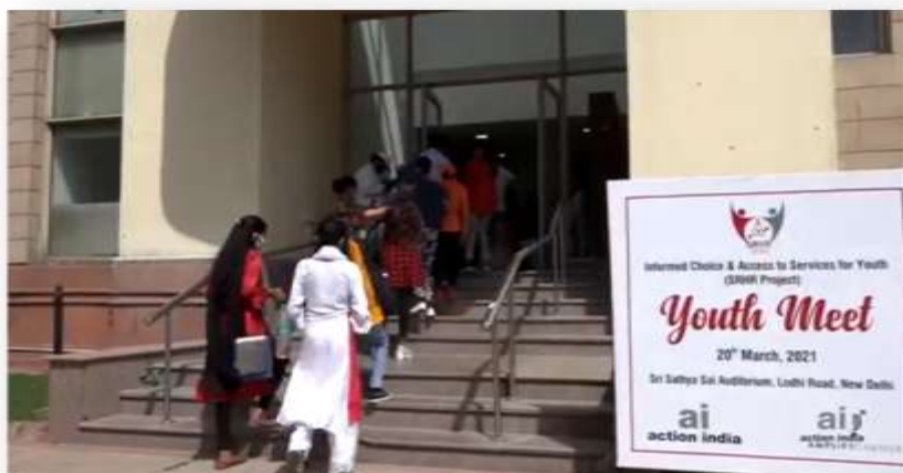
Youth Meet 20th March, 2021

Organized Youth Meet on 20th March, 2021 attended by 200 beneficiaries. Selected community leaders and peer educators shared their learning. LGBTQ groups participated and performed during the Meet. The Youth Demand Charter was Presented specifically on SRHR issues. Director WCD, Delhi and Consultant UN WOMEN/ WCD, Delhi attended the Meet and encouraged us to work more.