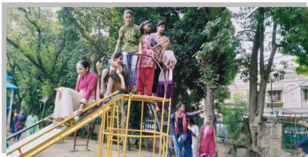
Learners enjoying a day out in a park.

Sports Days are hosted on a monthly basis with the aim to provide girls and women the opportunity to step out of their homes and engage in physical activities. Places like parks and grounds have always been dominated by men and boys. Our aim is to encourage learners to reclaim these spaces and make physical activities a part of their lives.