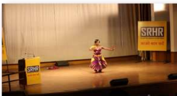
Youth Meet Performance by Transgender groups

Most of the LGBTQAI+ are not aware of their rights. they don't know how to access the service providers. Capacity building of LGBTQAI+ on Advocacy Skills and Services Available will empower them to access the available services.